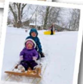
We have a large yard for playing, running around, and gardening.

We have a large yard with a garden, fruit trees, playset, and lots of room to run around. We love our friendly neighbors! We enjoy being a few minutes away from many parks, highly-rated schools, shopping areas, the library, and our home church. We are close to the beach and water, but also close to a large city that frequently hosts many community and cultural events throughout the year.