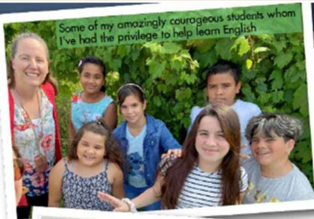
Some of my amazingly courageous students whom I've had the privilege to help learn English