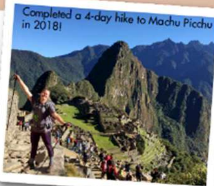
Completed a 4-day hike to Machu Picchu in 2018!