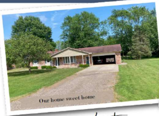
Our home sweet home