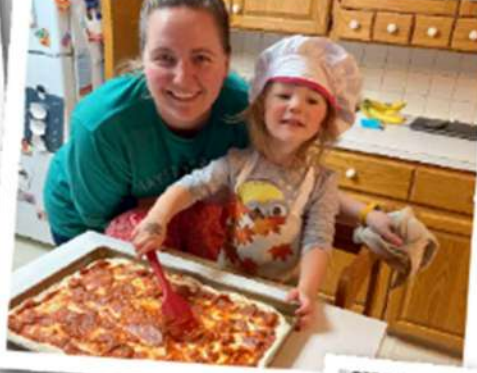
We love cooking with healthy food from the garden, baking new creations, and hosting gatherings with loved ones!