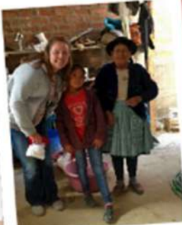
I got to meet the girl I've sponsored for 10+ years when I went to Peru!

I enjoy living a simple, down-to-earth lifestyle. I'm an introvert but thrive on maintaining close relationships with my friends and extended family. I have a heart for helping people. I enjoy organizing, scheduling, and keeping track of all the details in the family!