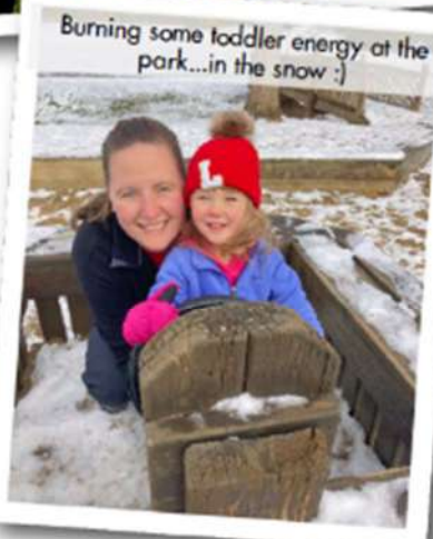
Burning some toddler energy at the park...in the snow :)