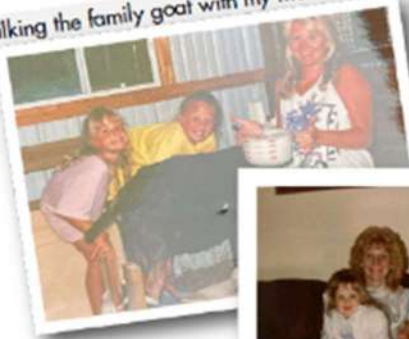
Milking the family goat with my mom and sister