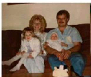
My dad, mom, sister, and baby me in 1989