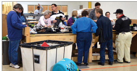
The Holland Rescue Mission offers a variety of helpful programs intended to help homeless men, women and children become independent.